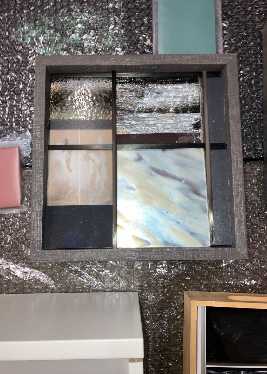
Studio view „Frost Under Plastic“ 20 x 20 x 10 cm Oil, spraypaint reverse glass, plexiglass, aluminium, textile, wood 2025