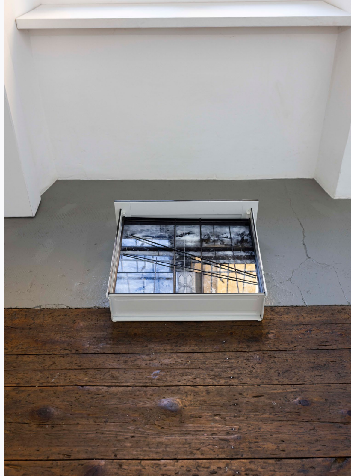
„Marks of Rain, Not Rain“ 60 x 55 x 30 cm Oil, spraypaint reverse glass, plexiglass, carbon, wood 2026