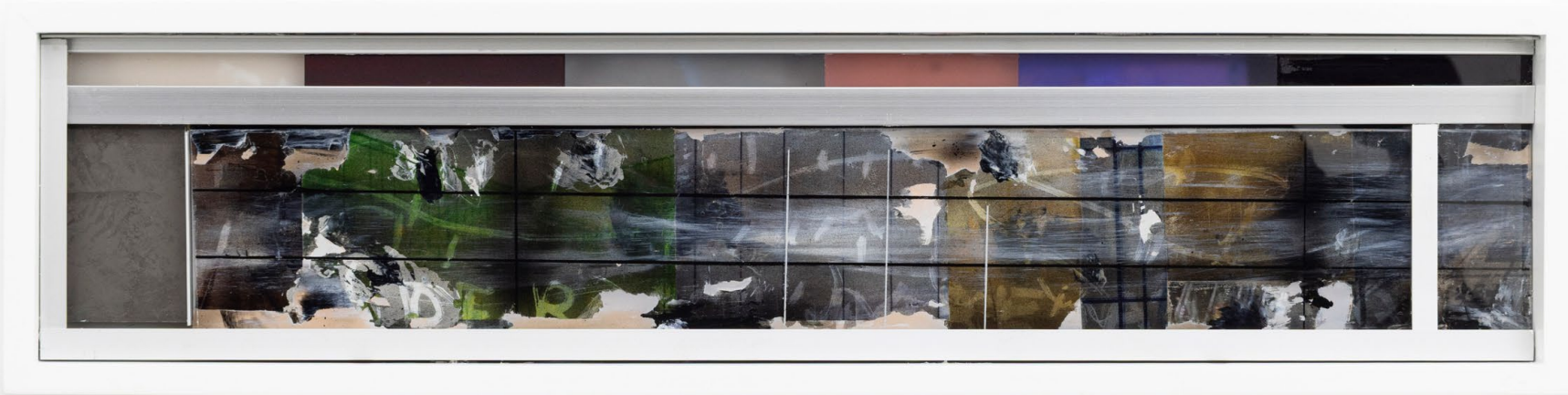
„Residual Thunder“ 60 x 10 x 4 cm oil, spraypaint reverse glass, plexiglass, aluminium, wood 2025