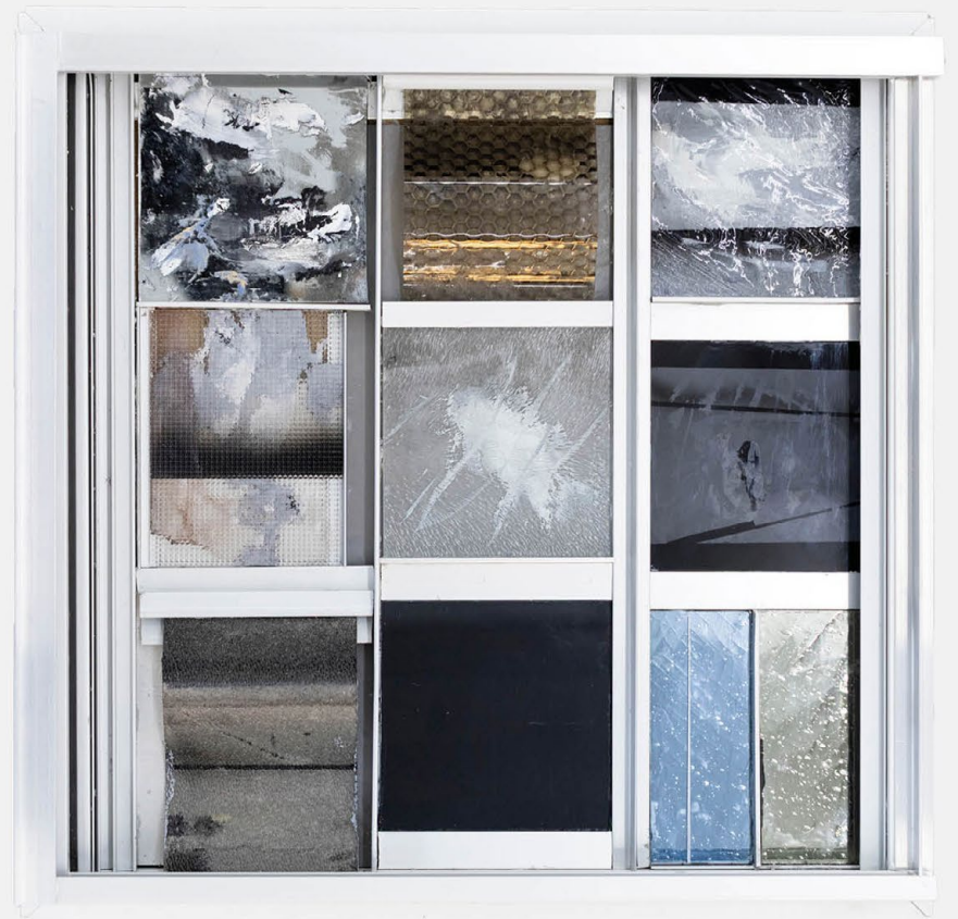
„Between Glass and Wall“ 35 x 35 x 35 cm Oil, spraypaint reverse glass, plexiglass, aluminium, wood 2025