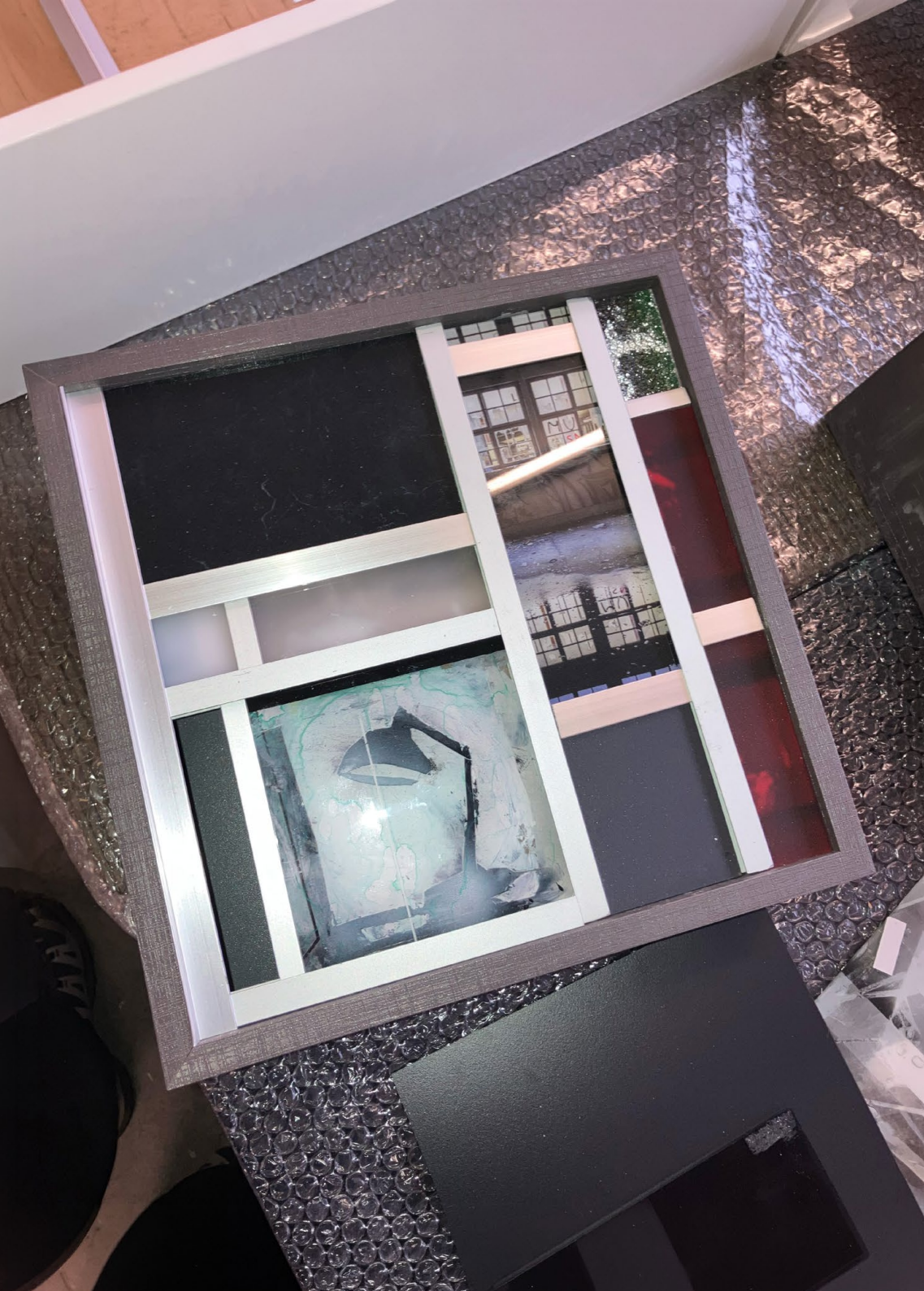
Studio view „Glass Between Two Images“ 40 x 40 x 10 cm oil, spraypaint reverse glass, plexiglass, aluminium, wood 2025