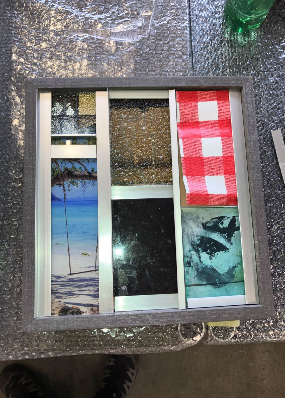
Studio view „Sliding Summer“ 30 x 30 x 10 cm Oil, spraypaint reverse glass, plexiglass, aluminium, textile, wood 2025