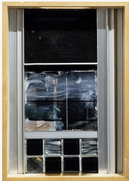
„Pixel Blocks in Haze“ 25 x 15 x 10 cm Oil, spraypaint reverse glass, plexiglass, aluminium, wood 2025