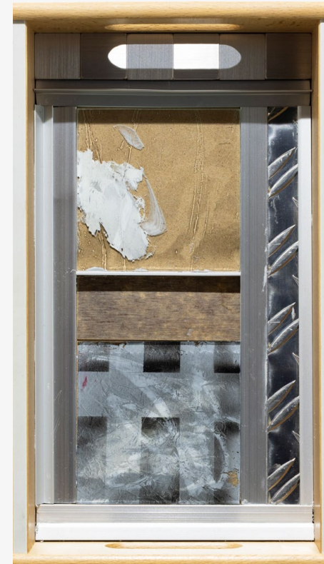
„Aluminium Silence“ 30 x 20 x 10 cm Oil, spraypaint reverse glass, plexiglass, aluminium, metal, wood 2025